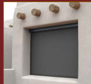
4 inch extruded aluminum housing