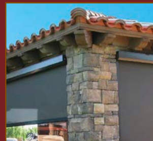
7 inch extruded aluminum housing