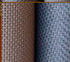
Available in 12% or 5% openness factors.