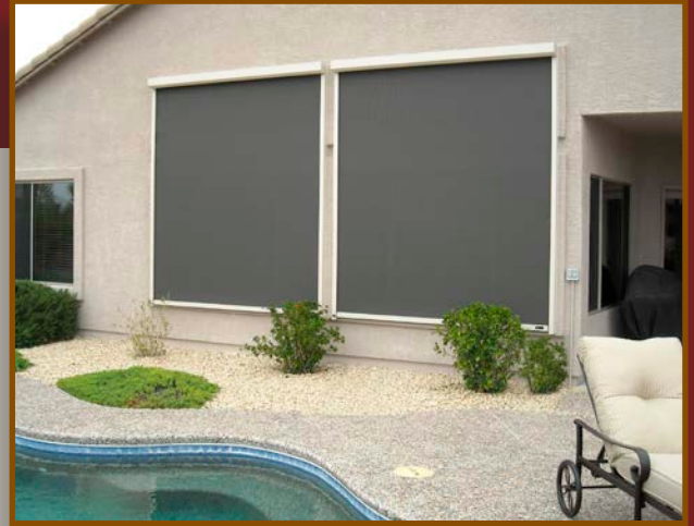
Eliminate glare and allow filtered light to pass through.

The Solution Screen has proven to be the most advanced and reliable retractable solar screen available.