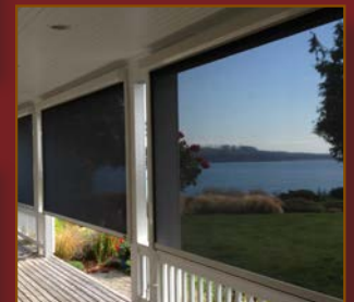
5 inch extruded aluminum housing