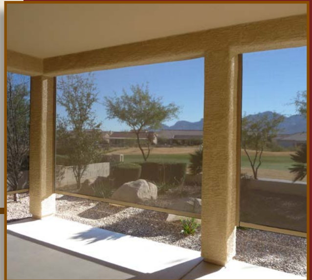
Keep your beautiful views without losing the protection.