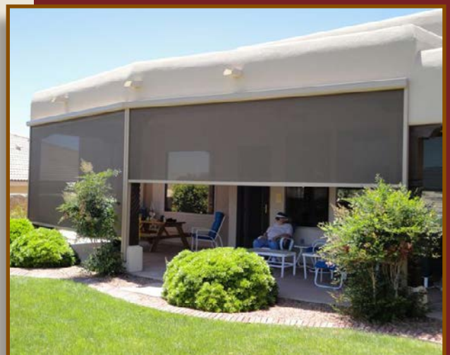
Transform your patio into an outdoor living area.