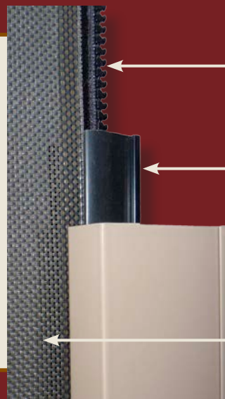
High strength zipper, weight tested to over 800 lbs.